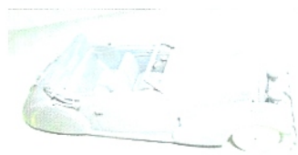
CARCH001 - Bugatti T57S Stelvio Gangloff Cabriolet