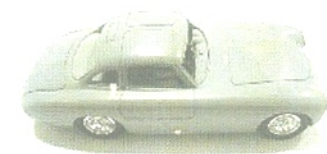
CARC007 - Mercedes-Benz 300SL Carrera PanAmericana 1952